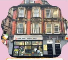
YPAS Central Hub 36 Bolton Street, L3 5LX