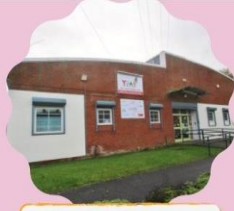
YPAS South Hub Lyndene Road, L25 1NG

We can support you through times of crisis